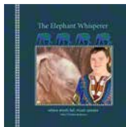
The Elephant Whisperer