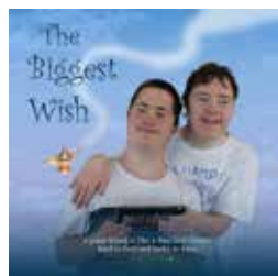
The Biggest Wish